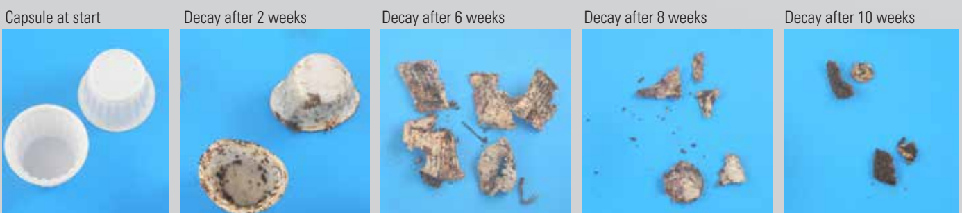
After a composting duration of 10 weeks only a minor amount of capsule material is left due to efficient decomposition.